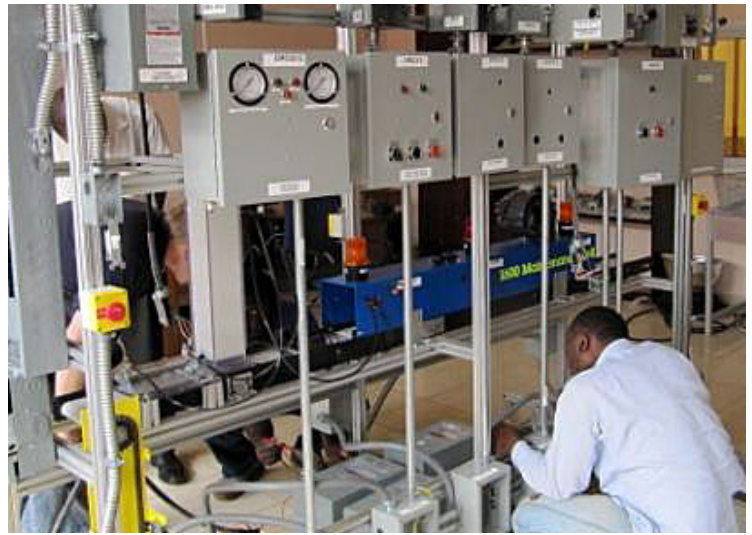
THE JOBMASTER 1600 MAINTENANCE CELL - CAPSTONE PROJECT