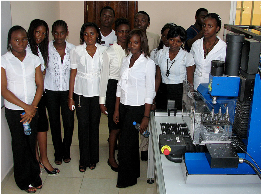
STUDENTS TOUR THE CNC LAB