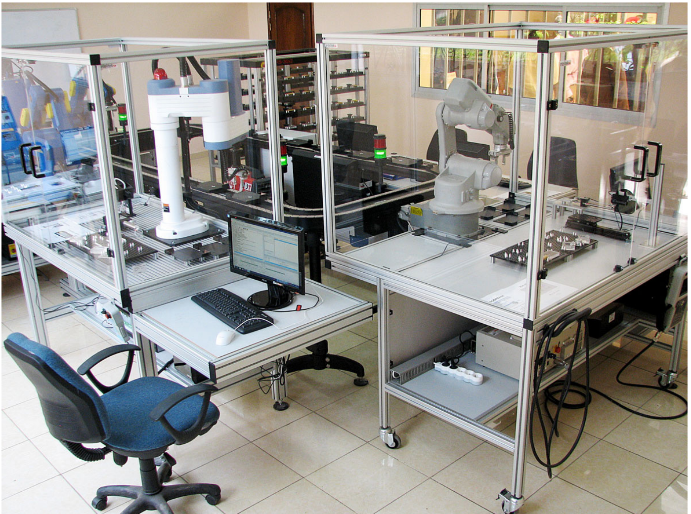
THE COMPUTER INTEGRATED MANUFACTURING (CIM) LAB

Robotic systems automate the warehouse and inventory control, and tend several manufacturing stations on the floor.